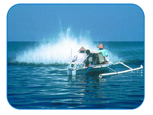
Blast fisherman in Indonesia uses explosives in order to capture fish taking refuge inside the living reef structure.

Centered in Hong Kong, the live food fish trade grew rapidly in the 1980s. Restaurant owners keep their live fish in glass tanks so that patrons can select dinner from a living menu. During the Asian economic boom years of the 1990s, this practice spread from the elite to the growing middle class, such that the number of live-fish restaurants increased rapidly, expanding from southern China throughout SE Asia. Demand soared for reef fish such as the humphead wrasse and several species of grouper.