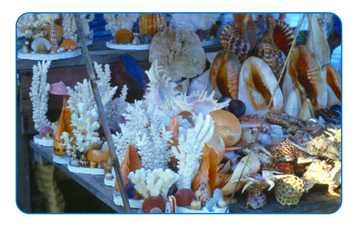
Coral and shells on sale in Vietnam.

Fishermen in both the live food fish and the marine ornamental trade have historically harvested using fish poisons including natural roots and cyanide. While there is a strong economic incentive to keep fish alive by using a small amount of poison, even modest doses can injure nearby fish and invertebrates. Additional damage to corals may occur when