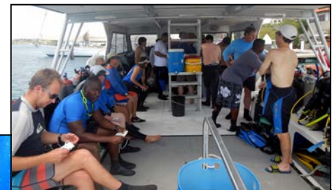
Coral Reef Ecology

The program will include the PFI Intermediate Freediver and Safety Freediver Instructor. Upon completion candidates will be able to teach the PFI Safe Buddy program. The course will run 6 days with 5 class, 4 pool and 5 ocean sessions. Potential dates for the course are July in Miami and August in Kona (exact dates TBD). If you are interested in attending, please contact the AAUS office, aaus@disl.org .