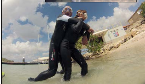
DSO Meeting