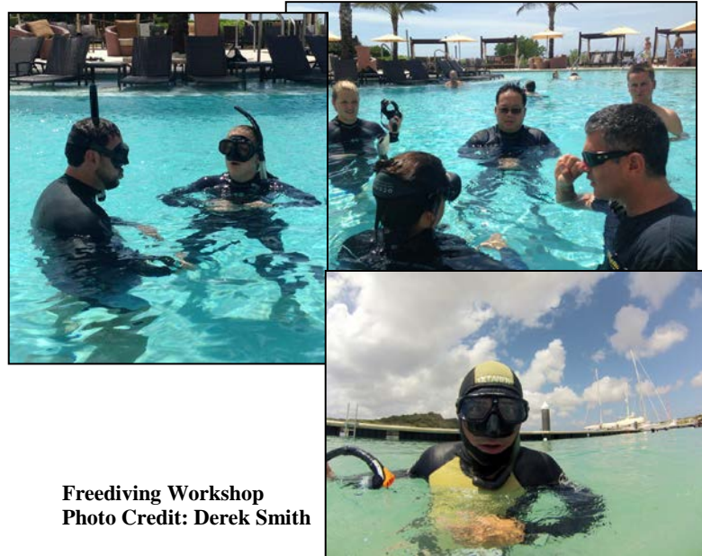
Freediving Workshop